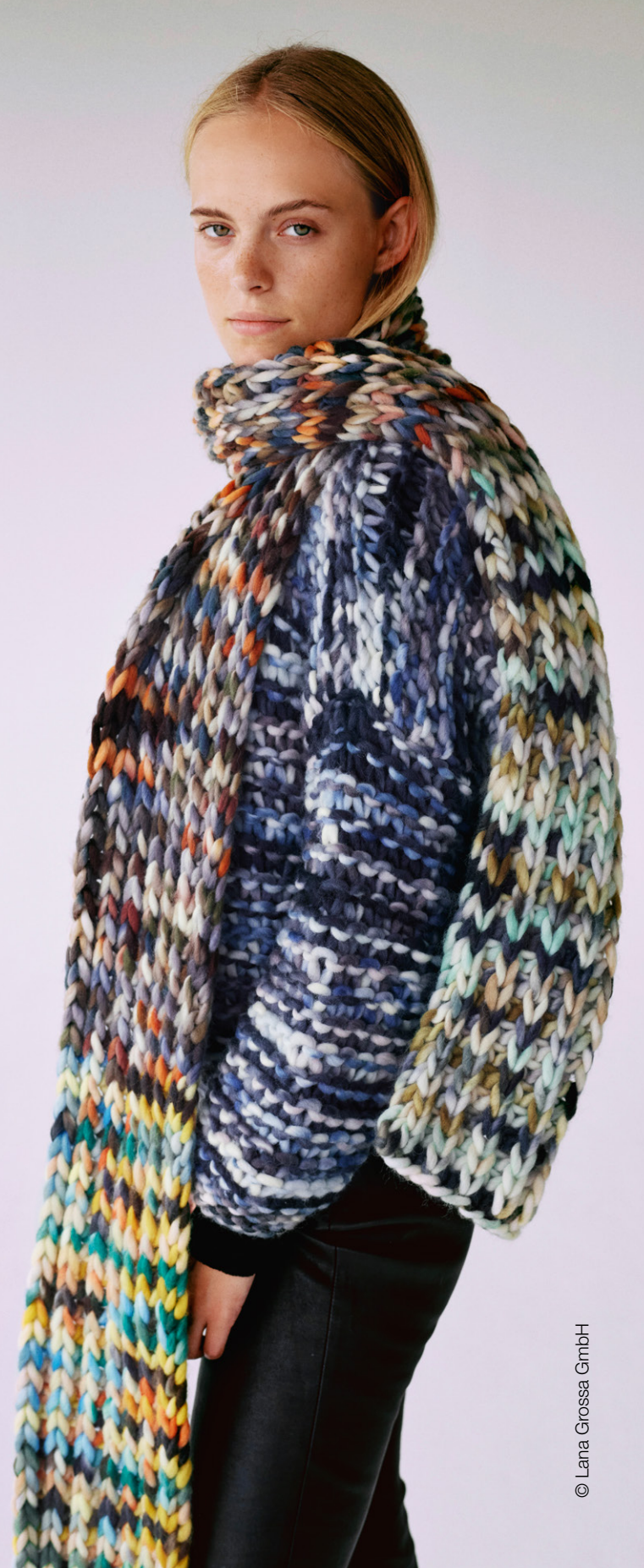
Design 8 – Flyer Confetti