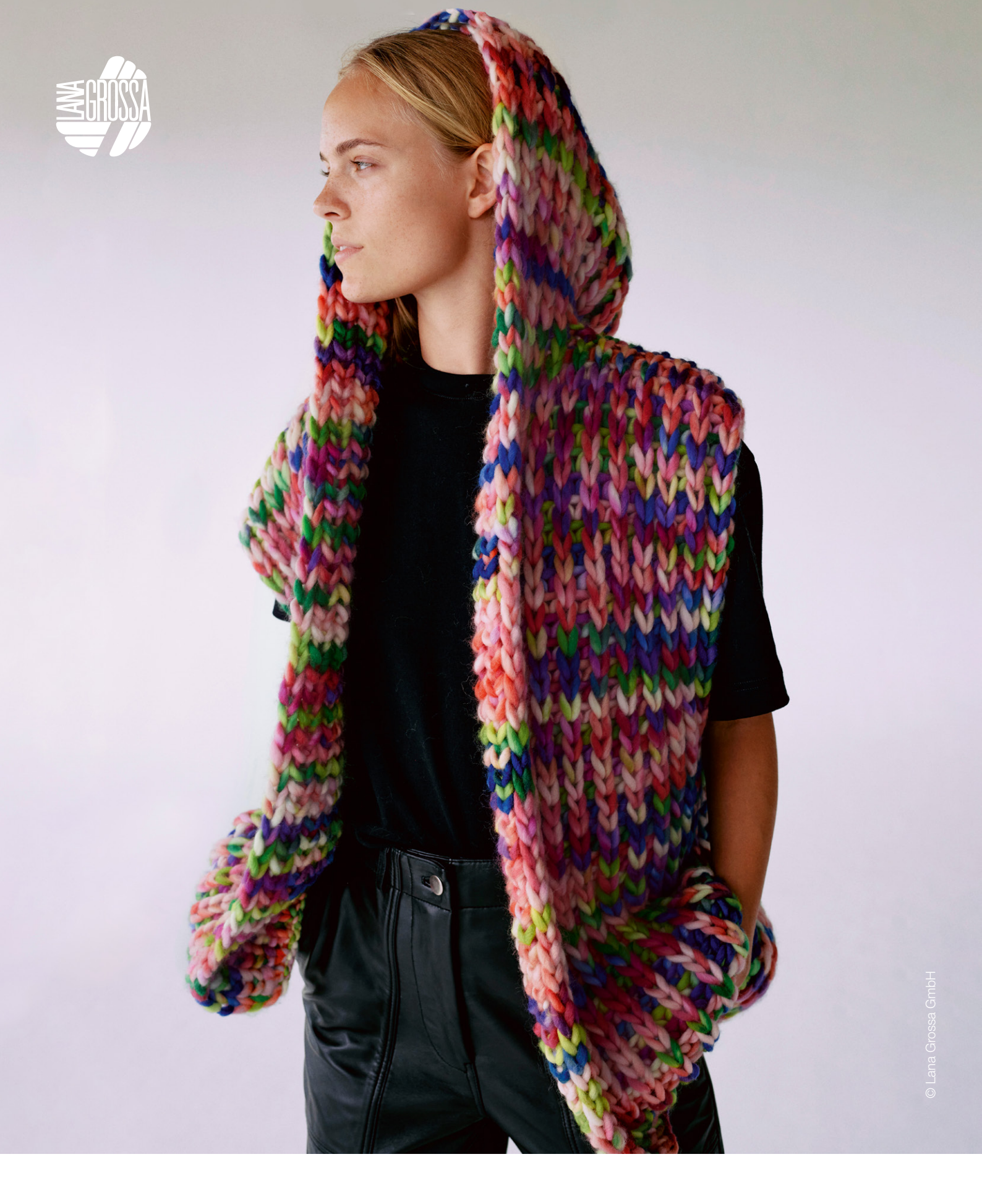
Design 6 – Flyer Confetti