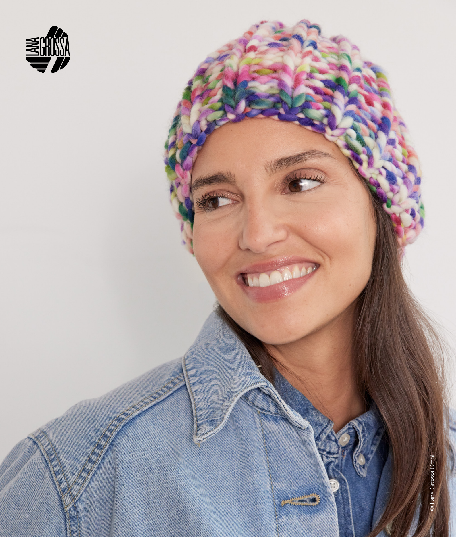
Design 5 – Flyer Confetti