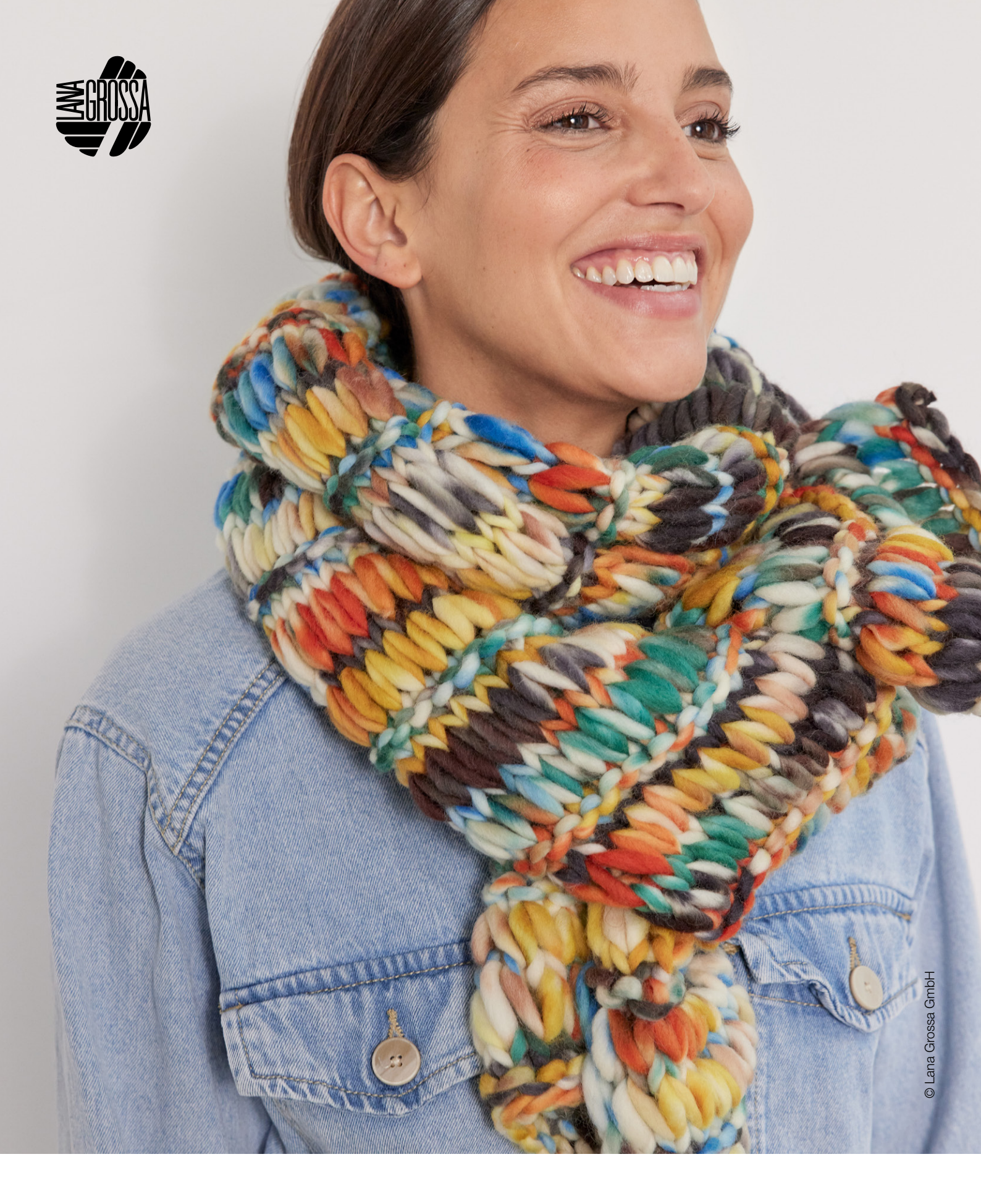
Design 3 – Flyer Confetti